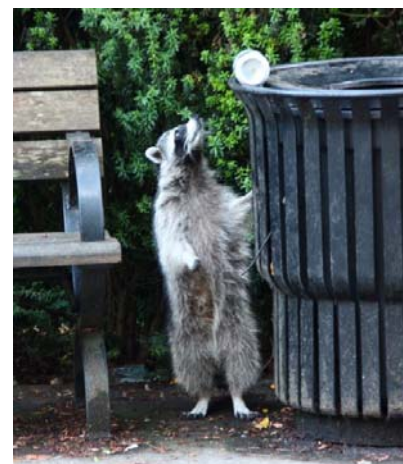
Raccoon at Stanley Park