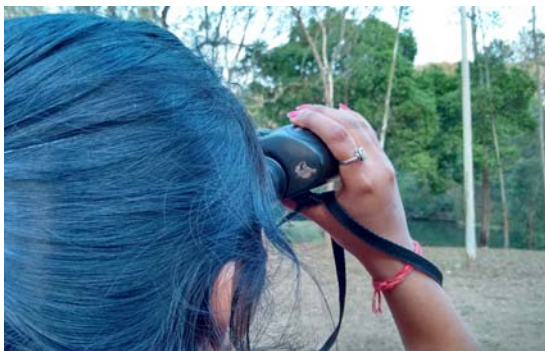
Bird Watching