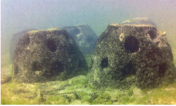
Rip rap or oyster reefs located just offshore of a marsh help to reduce the energy of waves hitting the coastline. Hollow concrete reef balls provide a manmade structure with functions similar to rip rap but designed to act as habitat for local fish and invertebrates. Under the right conditions, reef balls may encourage the establishment of oysters leading to an oyster reef.