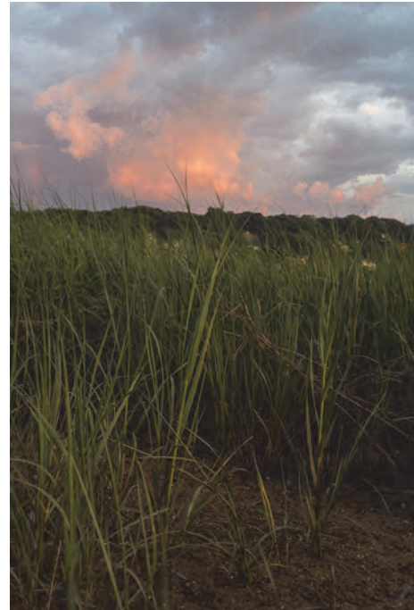
Salt marsh, as part of a living shoreline.