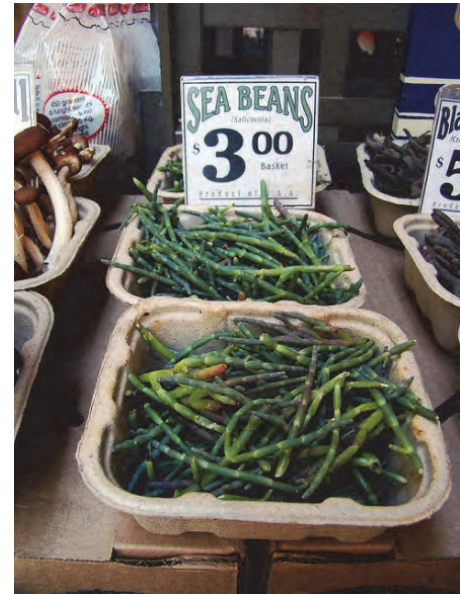
Sea beans or Samphire ( Salicornia sp.), are a group of common marsh plants harvested for human consumption.