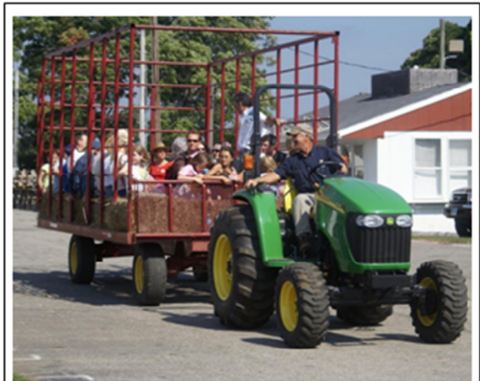
A family fun hayride at Celebrating Agriculture.