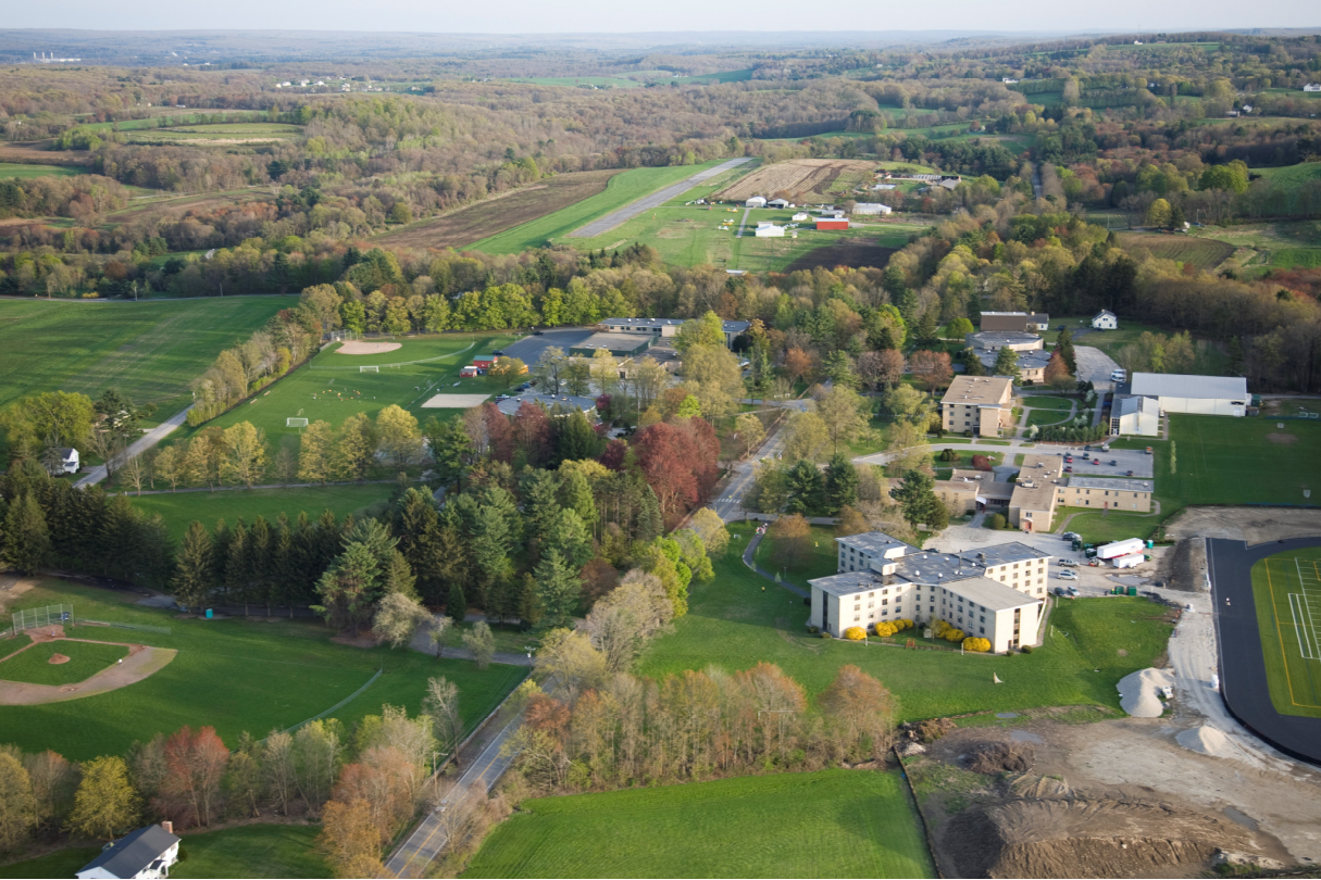
Woodstock Middle School on left near public ball fields, Hyde School is on the right.